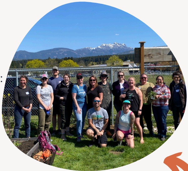
Teachers participating in the garden workshops at the district ProDay

A significant component of the Grow Local Initiative is the rejuvenation of school gardens. Efforts have been concentrated on four schools: Francophone School, ADSS, Eighth Avenue, and EJ Dunn, with initial site visits conducted by key stakeholders. Professional development opportunities, such as the ProD Day event on April 19th, involved 22 teachers and included interactive sessions and networking.